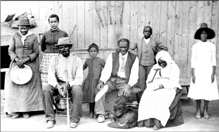
Tubman (far left) poses for a photograph with her family and neighbors in Auburn, N.Y.